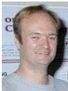
Michael Lindsay First Time Meeting Attendee Award