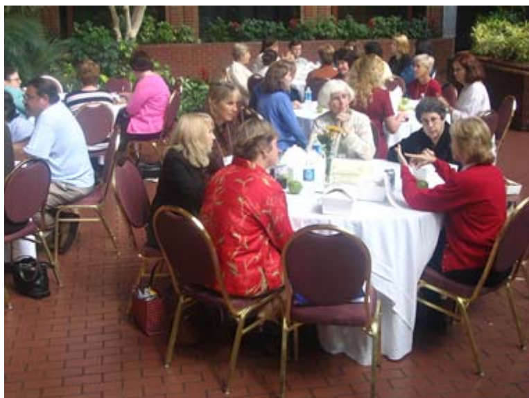
Roundtable discussion at MAC's 2005 Charlottesville meeting

Thanks for the great response to the recent Roundtables Survey. We received topic suggestions and replies from 107 members of both chapters. Your input was greatly appreciated and will help the committee members in selecting topics to offer. Based on the returns, the "hottest" topic (with 80 very interested or interested responses) was (drum roll), What technologies would users like (or expect) for libraries to support? Once we develop the final list of table topics, we will be asking for your help as facilitators and recorders. Attendees will need to pre-register and indicate their preferred topics on the meeting registration form. Any comments or suggestions can be sent to Julia Shaw-Kokot , (919)-966-0952 or jsk@med.unc.edu .