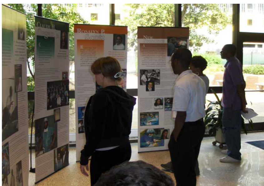
Visitors enjoying the Opening Doors exhibit