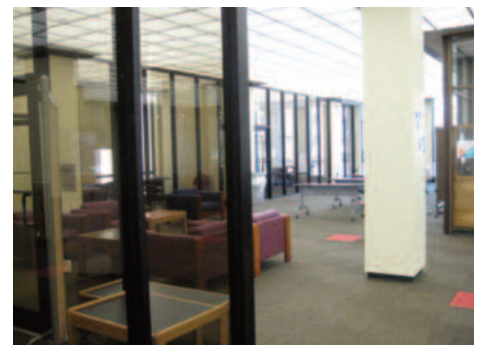
New study area