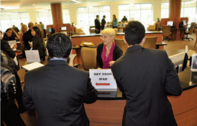
First year medical students are all smiles as they line up to get their new iPad 2!