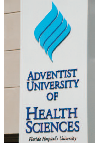
Adventist University of Health Sciences