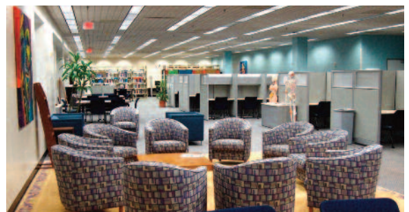
Medical Library, Herbert Wertheim College of Medicine, Florida International University

The initial renovation plan considered dividing the library into two zones, one for quiet individual study and one for small groups. The difficulty, however, would be managing noise since air handling could not accommodate segmentation with partitions. A "town hall"