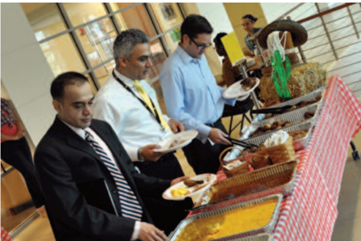
UCF College of Medicine faculty at the buffet table during the library's annual Faculty Appreciation Luncheon.

The Health Sciences Library has started a new tradition of showing its appreciation to College of Medicine faculty. Last August the library invited faculty to a casual and catered lunch where colleagues could mingle and relax before gearing up for the new semester. This year the library continued the tradition with a fun barbeque themed Faculty Appreciation Luncheon. Gingham tablecloths and bales of hay decorated the atrium in front of the library, where faculty lined up to feast on barbeque delights. This year's lunch was equally well attended and well received, ensuring a lasting annual fete.