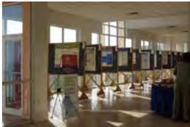
Student Research Posters