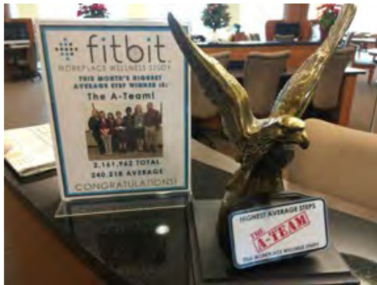
The first monthly winning team, the “A-Team”, of the Health Sciences Library’s Fitbit study, had their name displayed on a trophy in the library.