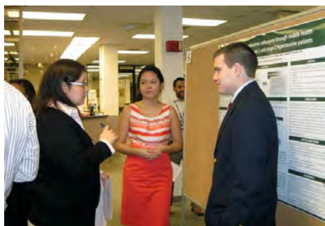
Pharmacy Poster Session

College of Pharmacy holds First Annual Grant Writing and Clinical Research Poster Session at the Shimberg Library: On December 6, the lobby of the Shimberg Library flooded with third year pharmacy students, for the First Annual Grant Writing and Clinical Research poster session. The posters were the culmination of a semester's worth of hard work, showcasing the research proposals for each of the ten student teams. It made for a very busy atmosphere in the library for a few hours as students discussed and defended their proposals. Everyone in attendance was invited to evaluate the posters, giving the students the opportunity to experience a variety of valuable feedback.