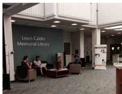
Calder sitting area

Our new furniture aims to promote a relaxing atmosphere so that patrons can enjoy a cup of coffee in the library and in doing so, also learn about our class offerings and library services.