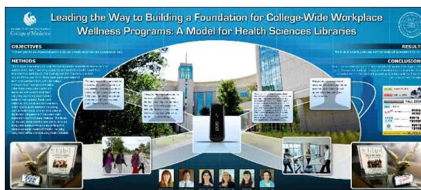
UCF MLA 2014 Poster