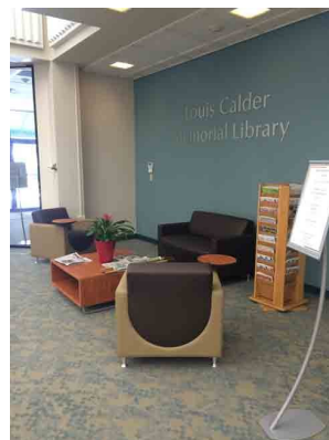
Calder Library entrance

We also are happy to report that, as expected, the opening of the Starbucks Coffee Shop in February has increased attendance at our library. We are starting to remodel parts of the library to encourage patrons to come enjoy their coffee on our new sitting area by the library entrance.