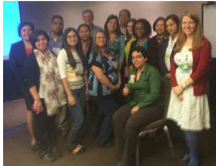
MLA Latino Sig Meeting