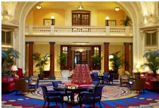
Lobby of the Battle House Renaissance Hotel

The 2014 annual meeting of the Southern Chapter/MLA will be held in lovely Mobile, AL on October 26-30. Mobile (Mo-beel, for those uncertain of the correct pronunciation) is a port city rich in history, having flown under the flag of six different countries since its founding in 1702. This multicultural influence is still felt through the oldest annual Carnival celebration in the United States, streets and parks named after French aristocracy, and Spanish influenced architecture. So don't be surprised when strolling back to the hotel after enjoying seafood gumbo and muffuletta sandwiches to see Mardi Gras beads dangling from towering oak trees dripping in Spanish moss.