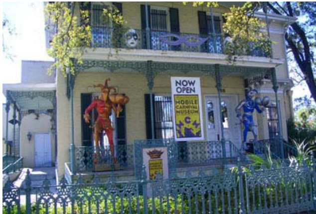
Mobile Carnival Museum

favorite spot for southern planters to get away to for a little rest and relaxation once their crops were planted, making it a center for Mobile's social scene. Fast forward 100+ years and it was also the site of one of Judy Burnham's high school proms. The hotel later fell on hard times and closed in 1970, but after a full renovation re-opened in 2007. Named one of the "Top 500 Hotels in the World" by Travel + Leisure magazine in 2009 and a member of the Historic Hotels of America, you can look forward to old world charm and modern conveniences.