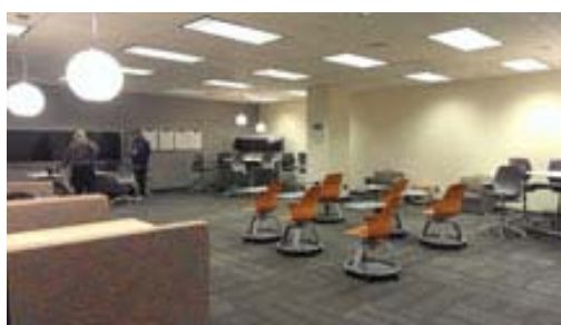
Collaborative Learning Center

Rowland Medical Library opens Collaborative Learning Center: Rowland Medical Library at the University of Mississippi Medical Center recently opened the Collaborative Learning Center (CLC). Occupying space that previously held a computer lab, the CLC features seven flat screen monitors and MediaScape furniture including three collaborative tables, movable chairs, desks, and booths. The CLC, designed to support interprofessional and collaborative learning, opened in December 2013. It is open to students and faculty of all campus schools during library operating hours.