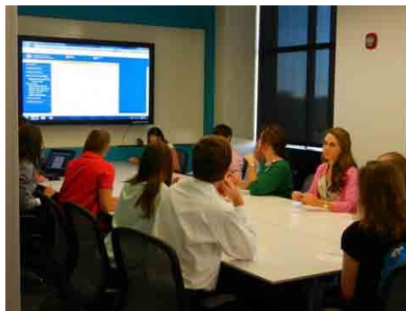
Library Speed Rounds