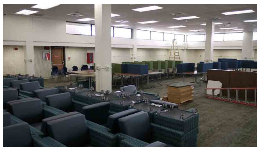
USF Shimberg Library Quiet Study Renovation

Renovations: The library's latest renovation is a 3,500 sq. ft. quiet study space which will be ready in the next month or so. A bathroom is being added to the 24/7 space and electrical outlets have been added throughout the entire library to provide students the electrical they need to power their devices.