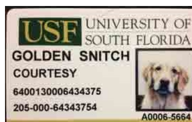
Library Ambassador Snitch

Shimberg Library introduces it’s newest employee... “Snitch”!