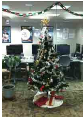
Borland Library X-mas Tree