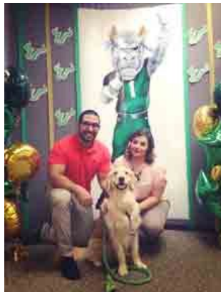
Snitch with COP Students