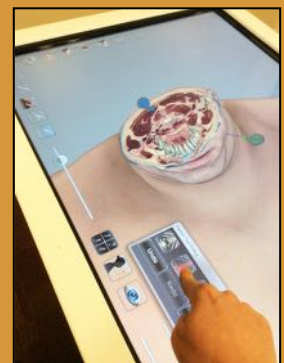
Using the table

On Tuesday, July 25 th , we turned the table on for the first time and held a training session joined by representatives on campus. We look forward to working with both faculty and students to make the best use of this new resource.