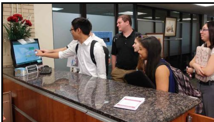
USF College of Pharmacy scavenger hunt

College of Pharmacy Scavenger Hunt: One hundred students from the USF College of Pharmacy class of 2021 began their first semester with a library orientation scavenger hunt. Students completed “tasks” such as submitting an ILL request and finding specific books, culminating in finding a journal article using the citation pieces collected at each point. This is the third year we have used this method of introducing students to the library and it continues to prove popular with students and more memorable than a lecture.