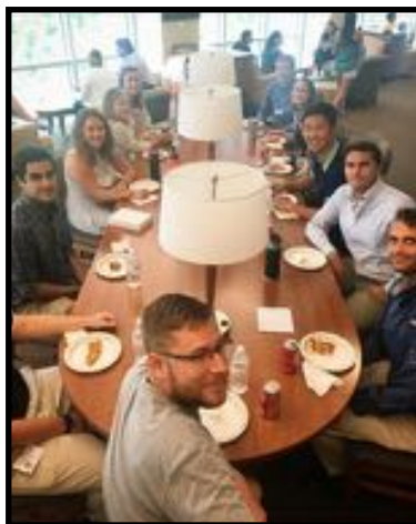
First year medical students from the Class of 2021 enjoy pizza in the library courtesy of their Personal Librarians.