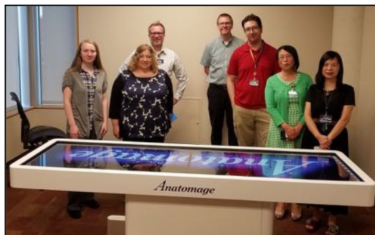
At the training session