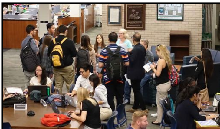
USF College of Pharmacy scavenger hunt