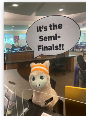
Library Llama promoting our Hoopla March Madness tournament.