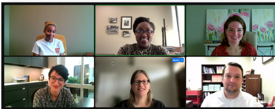
ALHeLA Health InfoNet of Alabama Committee

Funding for the needs assessment is being provided by a research grant from the Southern Chapter of the Medical Library Association (SCMLA).