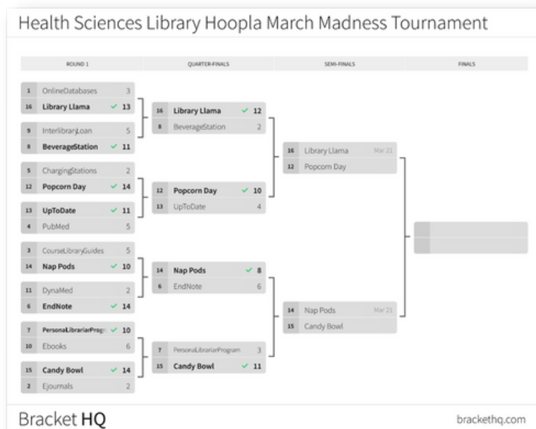
The Hoopla March Madness tournament brackets as of the semi-finals.

This activity has been a fun way to engage our users while promoting library resources, services, and programs. It has also allowed us to assess what our users value and appreciate about the library.