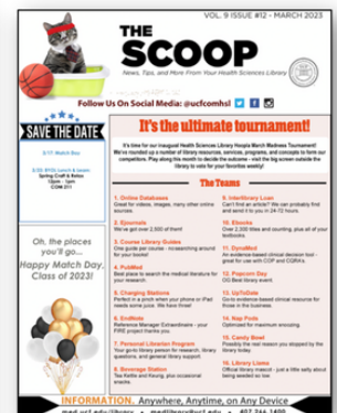
Our March 2023 bathroom newsletter, The Scoop, detailing the 16 Hoopla March Madness teams.