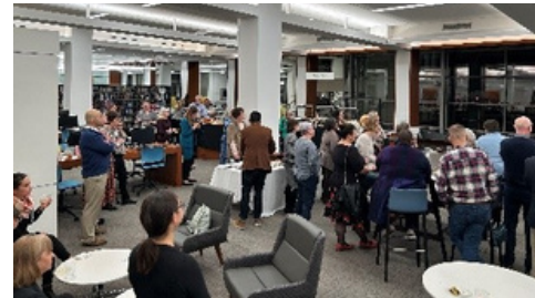
Academic Health Sciences Libraries Reception at EBL