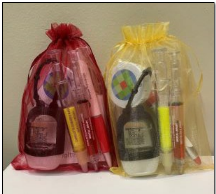
Maguire Medical Library's Orientation Welcome Bags for students.

All of this is just a snapshot of the library's involvement in academic, clinical, and research programs, but each year it reminds us of how all of our libraries serve a critical role in welcoming new students and residents, and creating an encouraging environment for everyone to engage in scholarly activity. Medical and health sciences libraries are a vital part of the success of our institutions, and opportunities like these that put us in front of our stakeholders yield dividends that can stretch across the entire academic careers of our patrons.